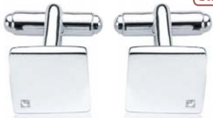
V208 ® features two princess cut diamonds