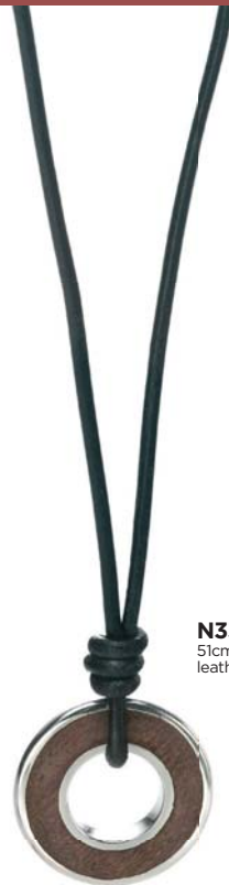
N3388 ® 51cm/20" leather necklace