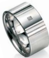
R3125 sizes 58, 60, 62, 65, 67 cubic zirconia