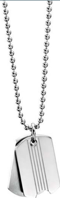
P3367 51cm/20" brushed and polished