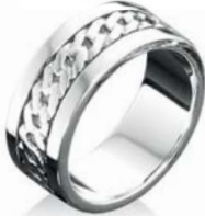
R3046 ® sizes 60, 62, 64, 67, 70