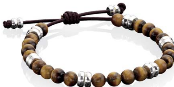
B3905 ® adjustable