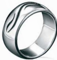
R2519 ® sizes 60, 62, 64, 67, 70