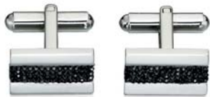
V414 ® crystal