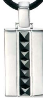
N3382 ® 46cm/18" leather necklace