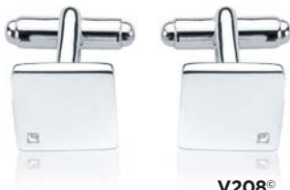
V208 ® features two princess cut diamonds