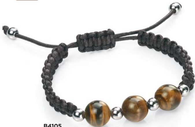
B4105 ® adjustable