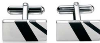
V365 ® resin