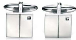
V431 cubic zirconia