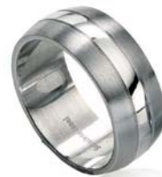
R2510 sizes 58, 60, 62, 65, 67