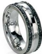
R3126 sizes 58, 60, 62, 65, 67 crystal