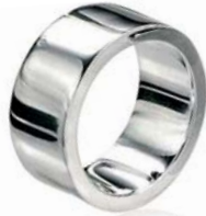
R2515 ® sizes 60, 62, 64, 67, 70