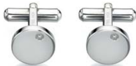
V423 cubic zirconia