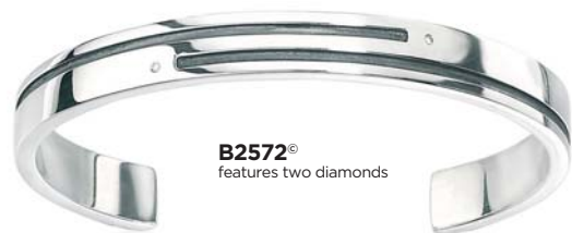
B2572 ® features two diamonds