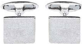
V188 ® scratched finish