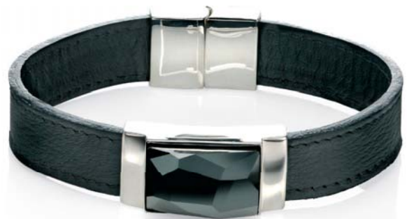
B4111 ® 23cm/9" leather