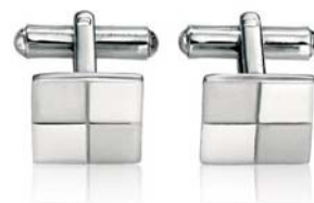
V319 brushed and polished