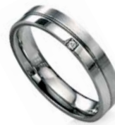
R2791 sizes 58, 60, 62, 65, 67 diamond