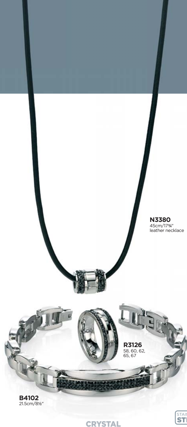
N3380 45cm/17¾" leather necklace