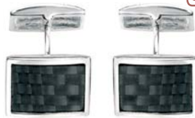
V343B carbon fibre