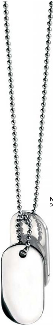
N2686 ® 56cm/22"