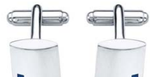
V210L ® features two blue sapphires