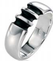
R2875 ® sizes 60, 62, 64, 67, 70 enamel