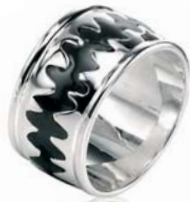
R2943® sizes 60, 62, 64, 67, 70