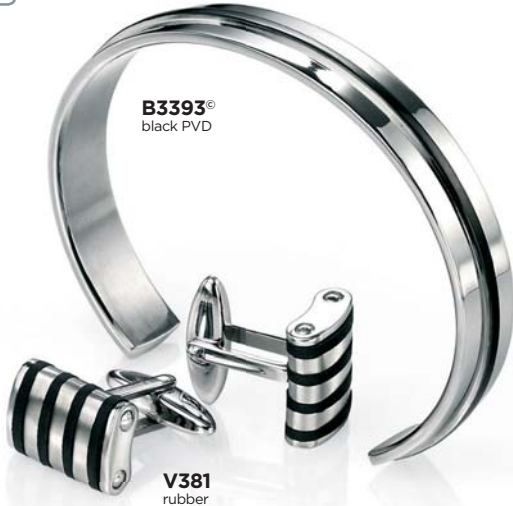
B3393 ® black PVD