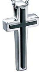
P3006 ® 50cm/19½"