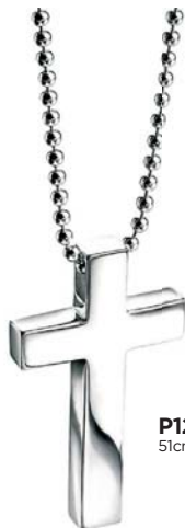
P1212 ® 51cm/20"