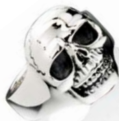
R3044 ® sizes 60, 62, 64, 67, 70 oxidised