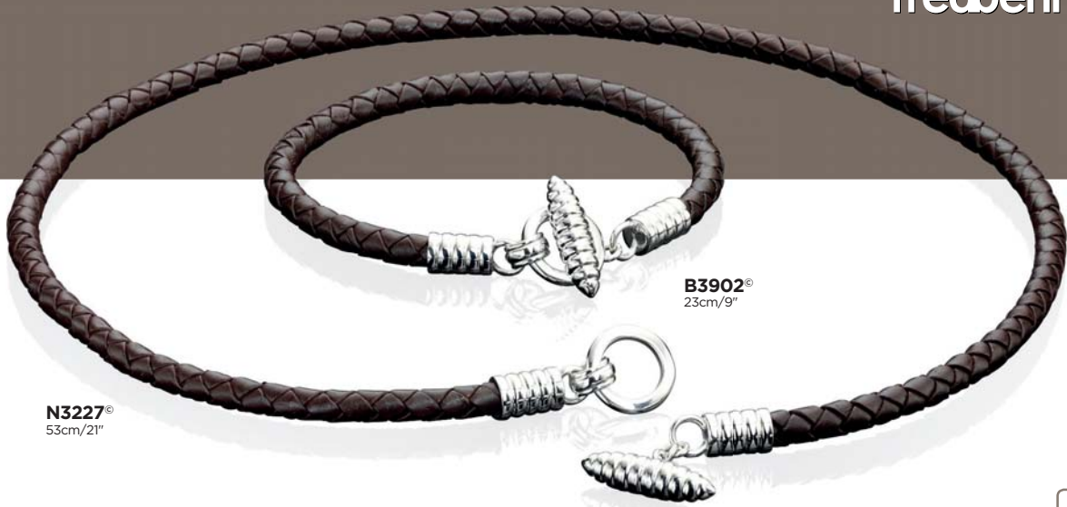
N3227 ® 53cm/21"