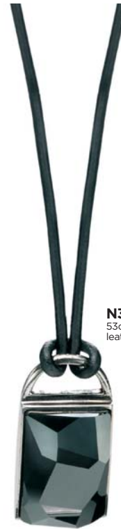
N3387 ® 53cm/21" leather necklace