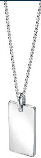
P2569 ® 51cm/20"