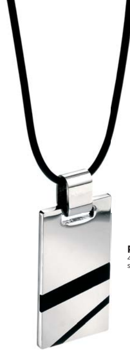
P2768 ® 45cm/17¾" silicon necklace