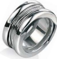
R2876 ® sizes 60, 62, 64, 67, 70