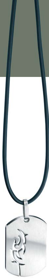
P2576 45cm/17¾" silicon necklace