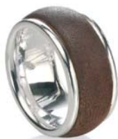
R3128 ® sizes 60, 62, 64, 67, 70