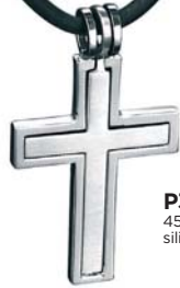
P3002 45cm/17¾" silicon necklace