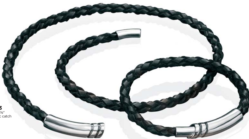
B2915 21cm/8¼" magnetic catch