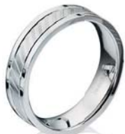
R3042 sizes 58, 60, 62, 65, 67