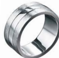
R2621 ® sizes 60, 62, 64, 67, 70 scratched and polished