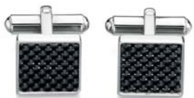
V421 carbon fibre