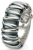
R3129 ® sizes 60, 62, 64, 67, 70