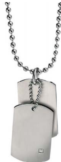
P3180 51cm/20" brushed