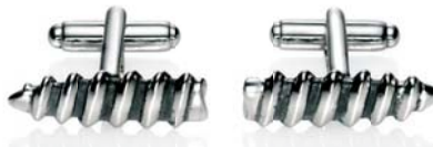
V456 ® oxidised