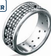
R2870 ® sizes 60, 62, 64, 67, 70 cubic zirconia and oxidised