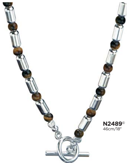
N2489 ® 46cm/18"