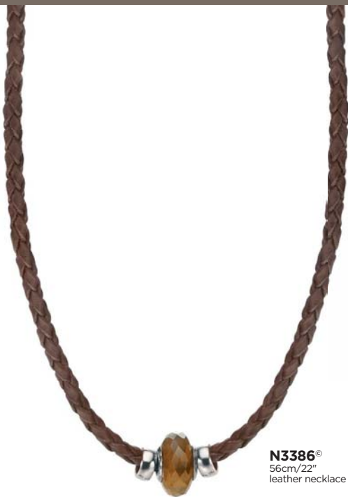
N3386 ® 56cm/22" leather necklace