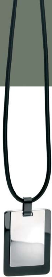
P3633 45cm/17¾" silicon necklace