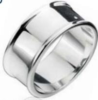
R3045 ® sizes 60, 62, 64, 67, 70