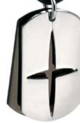
P3181 45cm/17¾" silicon necklace