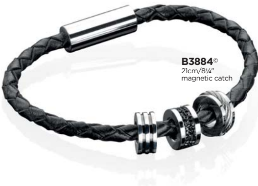
B3884® 21cm/8¼" magnetic catch