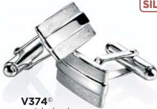
V374 ® scratched and polished