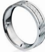
R3042 sizes 58, 60, 62, 65, 67