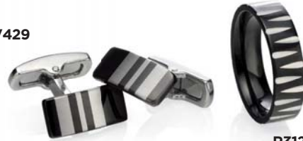
R3124 sizes 58, 60, 62, 65, 67