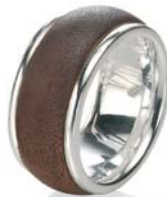
R3128 ® sizes 60, 62, 64, 67, 70 wood