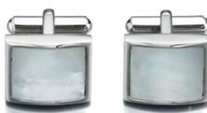
V422 mother of pearl