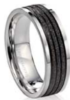
R2793 sizes 58, 60, 62, 65, 67