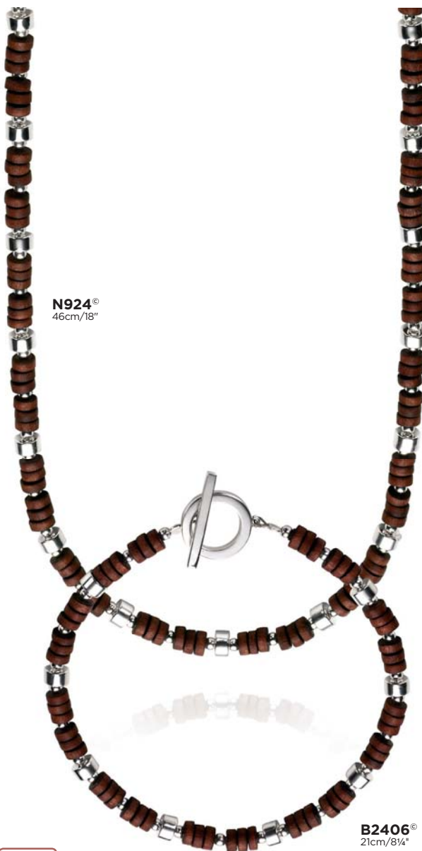
N924 ® 46cm/18"