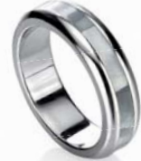
R3127 sizes 58, 60, 62, 65, 67 mother of pearl