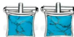
V433 ® imitation turquoise