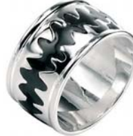
R2943 ® sizes 60, 62, 64, 67, 70 enamel