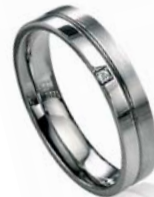
R2791 sizes 58, 60, 62, 65, 67 brushed and polished