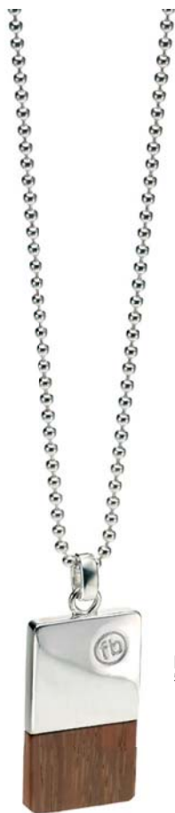
P3733 ® 51cm/20"