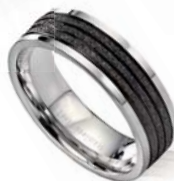
R2793 sizes 58, 60, 62, 65, 67 textured black PVD