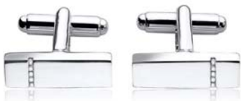
V222 ® features ten diamonds