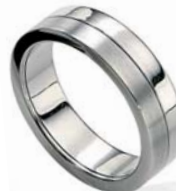
R2511 sizes 58, 60, 62, 65, 67 spinning ring