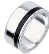
R955B ® sizes 58, 60, 62, 64, 67, 70 resin