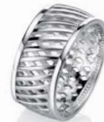
R3176 ® sizes 60, 62, 64, 67, 70