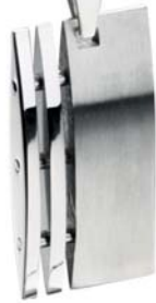
P3372 45cm/17¾" silicon necklace