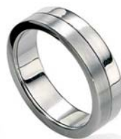
R2511 sizes 58, 60, 62, 65, 67 spinning ring