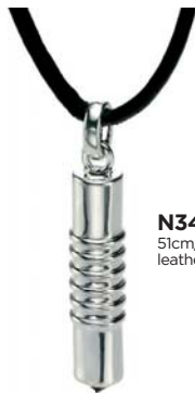
N3450 ® 51cm/20" leather necklace