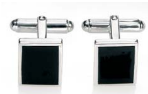
V327B black agate