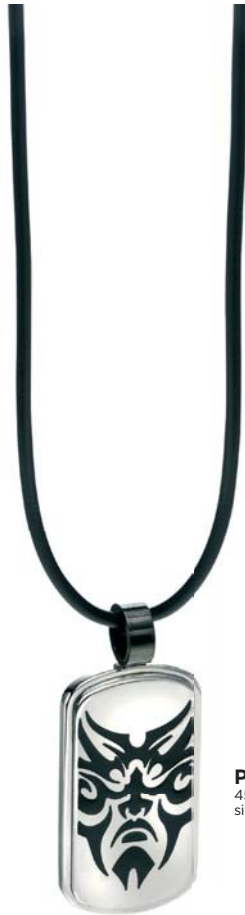
P3632 45cm/17¾" silicon necklace