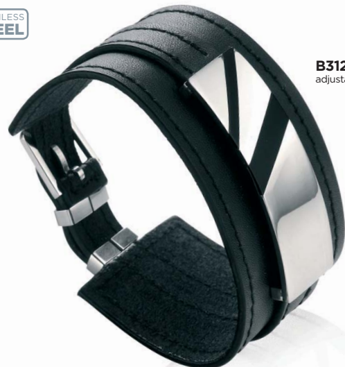
B3122 ® adjustable