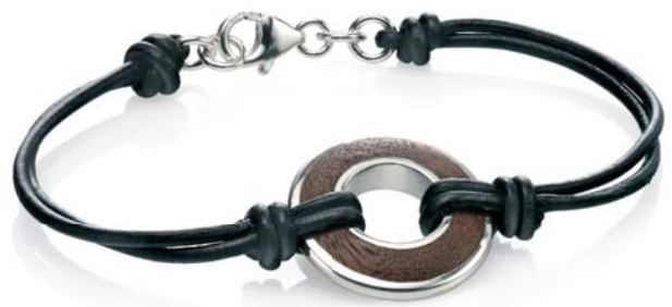
B4112 ® 22cm/8¾" leather bracelet