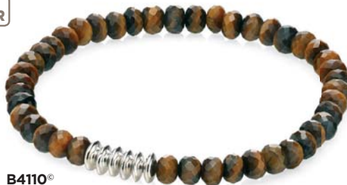
B4110 ® stretch