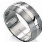
R2510 sizes 58, 60, 62, 65, 67