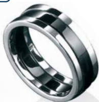
R2727 sizes 58, 60, 62, 65, 67 black PVD