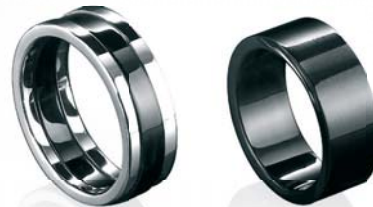
R2727 sizes 58, 60, 62, 65, 67