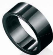
R2729 sizes 58, 60, 62, 65, 67 black PVD