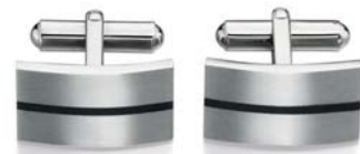
V424 brushed and black enamel