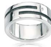
R2413 ® sizes 60, 62, 64, 67, 70 features two diamonds