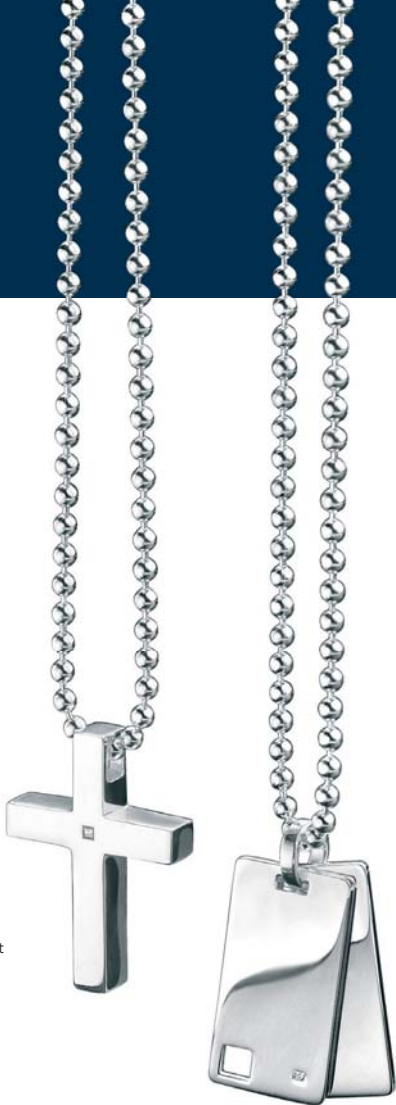
P2010 ® 51cm/20" features princess cut diamond