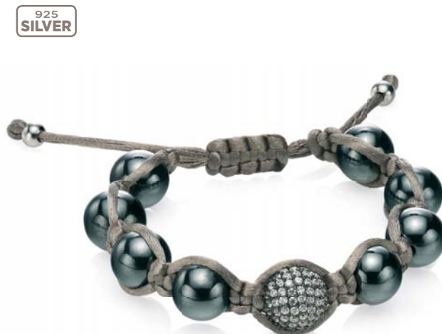
BLACK AGATE AND CUBIC ZIRCONIA