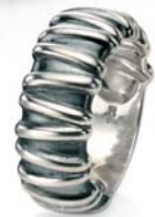
R3129® sizes 60, 62, 64, 67, 70