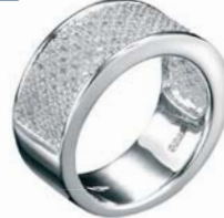
R2141C ® sizes 60, 62, 64, 67