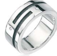
R2413 ® sizes 60, 62, 64, 67, 70 features two diamonds